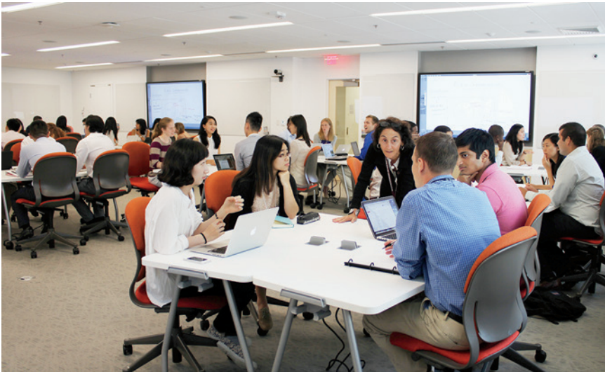
Faculty and Students Interacting in Learning Studios at Harvard Medical School.

In the “Pathways” curriculum, students focus on the application of concepts to solve clinical problems. Selected lectures remain in most courses to create frameworks for subsequent learning.